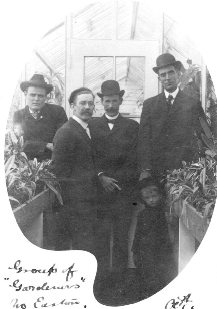
Group of "Gardeners" No Easton, Mass. Oct. 1906.