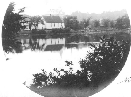
Old Catholic Church. 1896. No Easton, Mass.