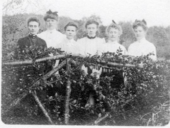
The "Maids" on Ames' Estate, 1904.