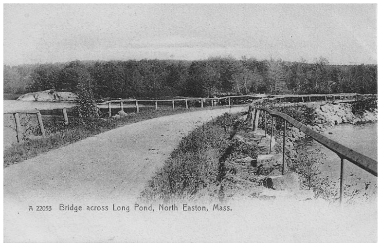
A 22053 Bridge across Long Pond, North Easton, Mass.