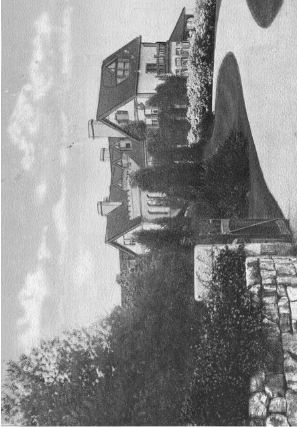
The Mansion at Sheep Pasture, Circa 1910. The house was torn down after World War Two. It's foundation is now filled, but the great wall remains facing south.