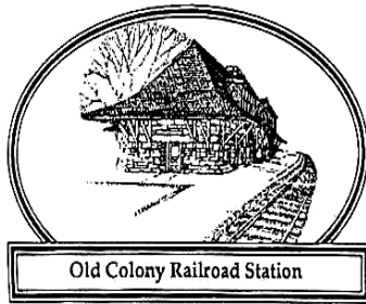
Old Colony Railroad Station

P.O. Box 3, 80 Mechanic Street North Easton MA 02356