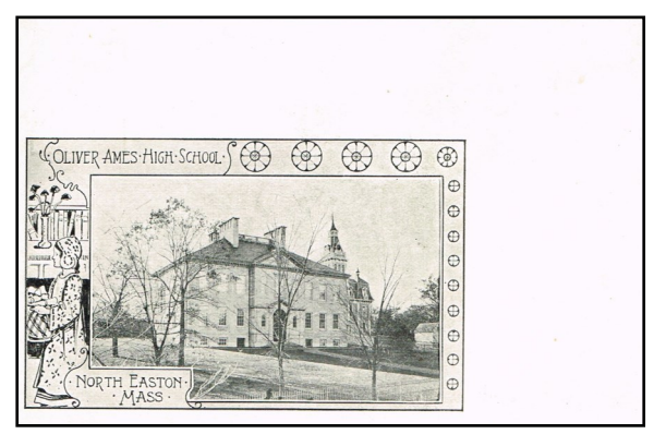
The 1895 Oliver Ames High School stands proudly overlooking North Easton. The space around the card provided room for a message.

One of our projects during this pandemic has been to scan images of Easton postcards for future projects. Below are a few examples for you to look at. We hope you will enjoy this postcard tour around town.