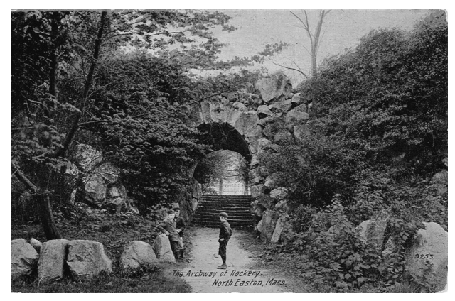
Three boys gather in the archway of the Rockery, a popular gathering spot for many years.