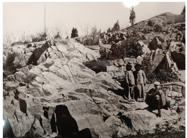
The rock face across from the entrance to Sheep Pasture. (Original photo)