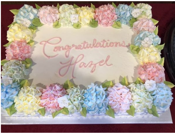
Delicious cake from White's Bakery.