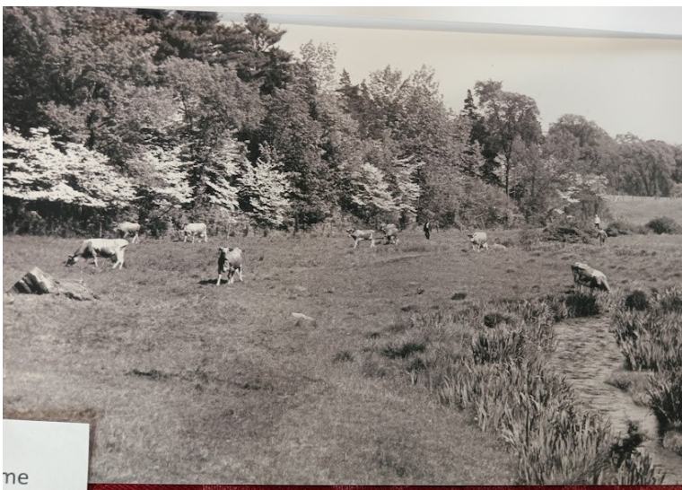
Photo of Sheep Pasture and cows wandering near Queset Brook.